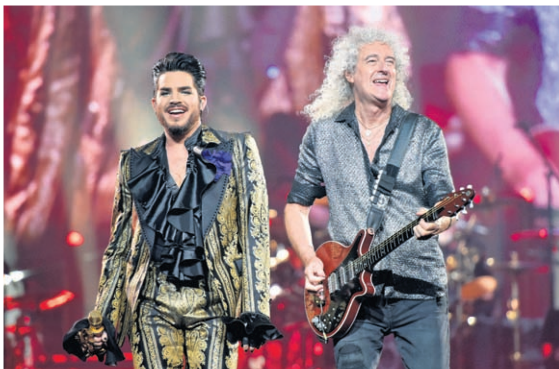
Adam Lambert, left, and Brian May of Queen + Adam Lambert perform in Chicago on Aug. 9, 2019.

"We do constantly try and keep ourselves interested because it's nice to change the show around, even in small ways," says drummer Roger Taylor. "Obviously we do some sort of deep cuts whilst at the same time keeping the big hits that everybody knows. People want to see what they know. But it's nice to spice it up with a few things they might not expect." The tour will make 14 stops throughout the U.S. and Canada, including shows in Baltimore, New York, Atlanta, Denver, Boston, Toronto, Chicago and Dallas, before closing out in Los